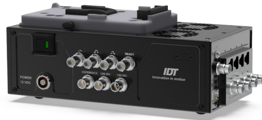
XStream Time Capsule